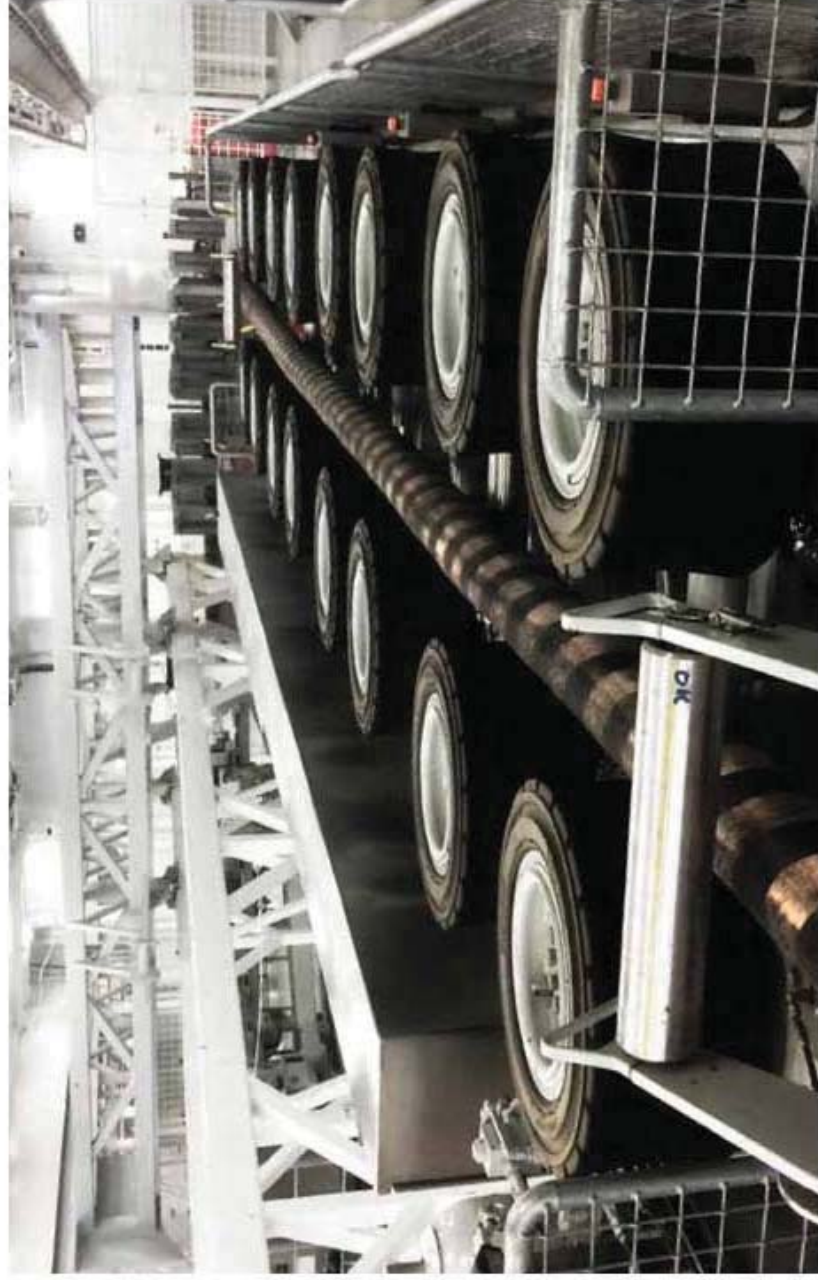
Particulars are believed to be correct, but without guarantee. Updated in August 2016.

Drammen Yard design and fabricate complete Carousel Packages for Cable Layers incl. DNV GL certified Offshore Carousels, Stowing Arms for un-manned loading, Spooling Arms, Loading Tensioners, Hold-back Tensioners, Cable Ways, Chutes and Quadrants, all Automated for single Control Stand.