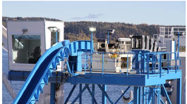
Technical particulars Loading Tower