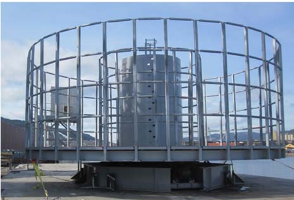
Technical particulars 2,000 Te Offshore Cable Carousel