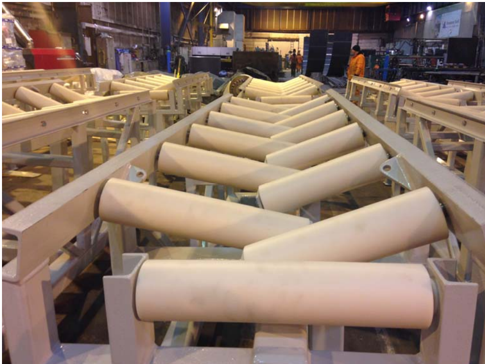
Cable Support Roller Sections